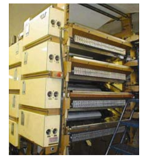
All Quad-Stacks, Quadra-Color, and Web Leader units*